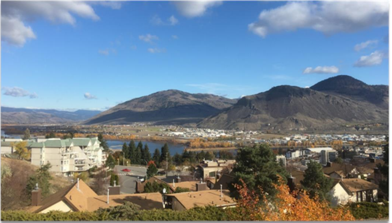
Meeting of the North and South Thompson Rivers, Kamloops