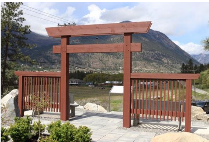
Torii gate framing the mountains at East Lilloet. Photo by Lydai Nagai Photography.

A celebratory poem from Shinshui Wakashu (New Gleanings from a Collection of Japanese Poems) I translated recently for a seminar and recalled as I was standing in the garden, surrounded by young pine trees, and looking out at the mountains while listening to the windchime beneath the torii gate. Translated by Bianca Chui.